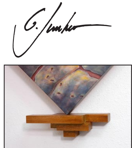
Solid African mahogany wall sconce