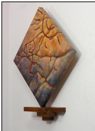
The painting appears to be balancing on the wall sconce

As the sun began stepping over the summit of Haleakala, Maui would snare its legs, breaking them off one by one. Down to its last leg, the Sun tried to flee but Maui threatened to kill the sun with his magic axe. The sun begged for its life and Maui spoke with the sun and both agreed that there should be longer days. Yet half the time the sun might go quickly as in the winter time, but the other half he must move slowly as in summer. Thus men dwelling on the earth should be blessed."